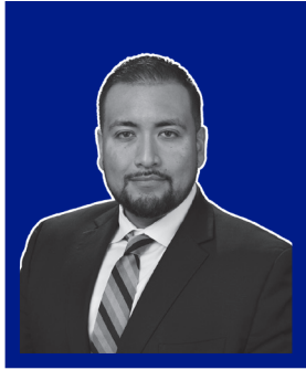
State Senator Javier L. Cervantes